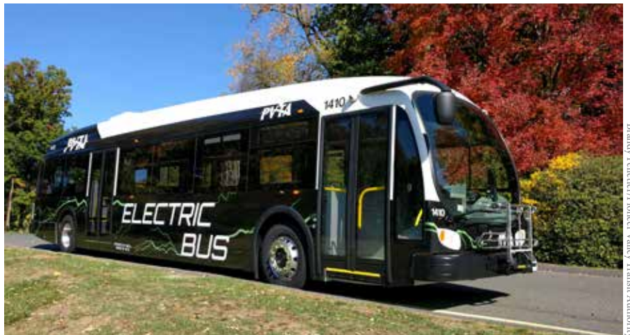
Massachusetts' Pioneer Valley Transit Authority is just one of a growing number of companies turning to electric vehicles in their fleets. These vehicles not only cost less to operate compared with their conventional counterparts, but also play a major role in reducing carbon emissions and air pollution in the region.

Together with efforts to provide residents with more transportation options through investments in public transportation, walking and biking infrastructure, and affordable housing near transit, these investments in clean vehicles and fuels can put the region on track to build a clean and modern transportation system. Furthermore, by directing investments toward the communities that need them the most, the region can make its transportation system more equitable (see the box, p. 2).