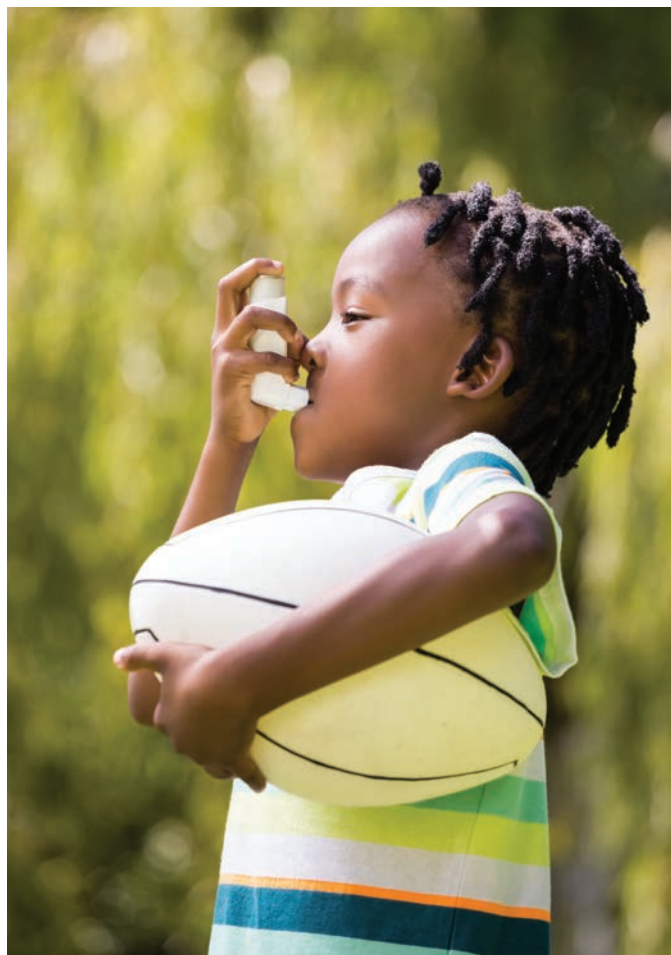
Air pollution exposure can lead to significant risk for developing respiratory disease and cancer. Children are especially vulnerable.

Children are especially vulnerable to the effects of toxic air pollution. In addition to daily exposure to toxic pollution in the