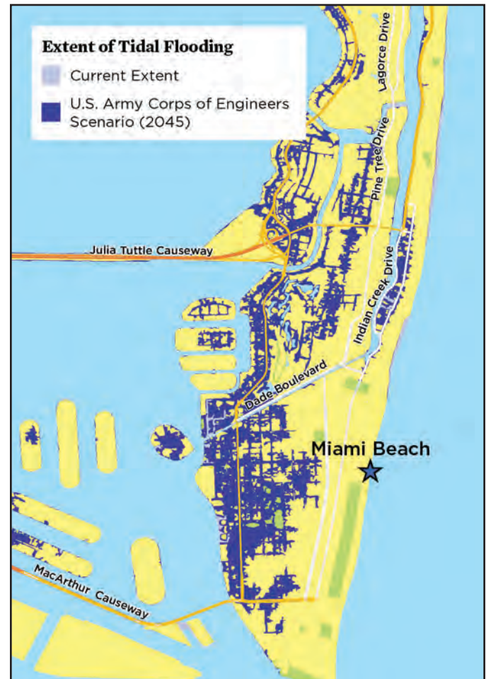
FIGURE 2. Miami Beach Extreme High Tide Flooding Today and in 2045

Based on a US Army Corps of Engineers sea level rise projection, Miami Beach is poised to see flooding associated with extreme high tides across most of the west side of the island in 30 years' time. The city of Miami Beach, dogged by tidal flooding in recent years, is taking steps to keep the water at bay. Without a rapid ramp-up of adaptation efforts, tidal flooding will only grow more problematic for the city.