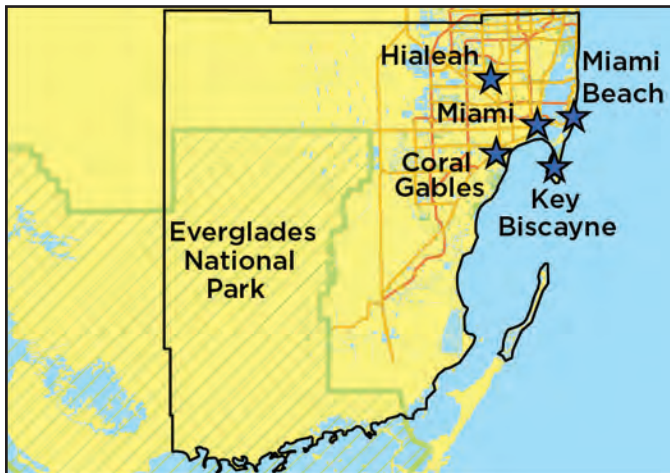
FIGURE 1. Miami-Dade County Overview

Miami-Dade County covers nearly 2,000 square miles, most of it flat, low elevation, and sitting atop porous limestone bedrock. The iconic wetlands of Everglades National Park account for one-third of the county's area. This map highlights the five locations discussed here, but sea level rise is a threat to low-lying areas along the entire coast, as well as to inland locations due to underground infiltration of salt water, an elevated water table, and backed-up rainwater in gravity-fed canals.