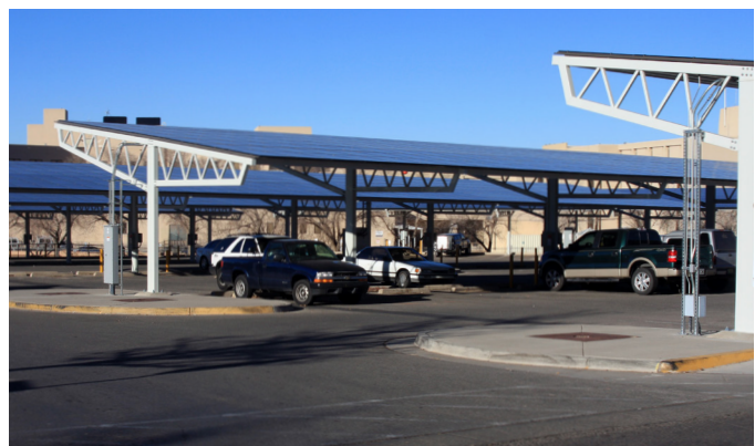
These solar-panel canopies, which provide shade for parked vehicles and generate electricity for the VA Medical Complex in Albuquerque, are just one way in which New Mexico is reaping the benefits of solar power. Accelerating the growth of renewable energy to help meet the state’s emissions reduction targets could stimulate more than $2.7 billion in capital investments by 2030, according to UCS analysis.

Our analysis also shows that a national mass-based emissions trading program with auctioned allowances would help New Mexico generate significant revenues. By setting a carbon cap and issuing allowances equal to its CPP targets, auctioning those allowances, and participating in an interstate carbon trading program, New Mexico could generate average annual revenues of $115 million per year from 2022 to 2030 under the Clean Path Case. These revenues could be used to further reduce consumer electricity bills or be reinvested for the benefit of the state’s residents. Investment options could include: additional deployment of renewable