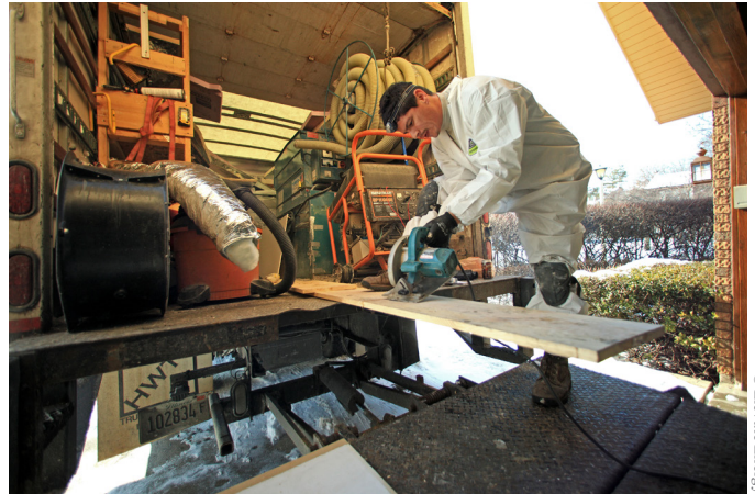
Home energy performance contractors prepare to air seal and insulate a single-family home. A CPP compliance plan that prioritizes efficiency efforts such as this can benefit all New Mexico residents.

New Mexico is well positioned to cost-effectively achieve its overall target by investing in many of the CPP's carbon-reduction options (as described in Box 1) and by participating with other states in a well-designed emissions trading program. Administering such a program by auctioning off emission allowances would also allow New Mexico to generate revenues that could be used to benefit all of its residents. Further, by complementing its CPP compliance plan with strengthened policies that support renewable energy and energy efficiency, New Mexico could accelerate its clean energy transition while increasing consumer, economic, and public health benefits.