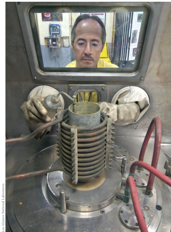
Los Alamos National Laboratory