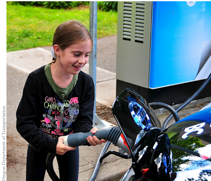
Oregon Department of Transportation