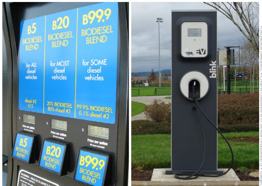
Biofuels and electricity are already helping to reduce Oregon's contribution to global warming. Strong policies such as the Clean Fuels Program are critical to ensuring the state's low-carbon fuel market can continue to grow.

Oregon already generates half of its electricity from hydropower and renewable resources like wind (ODE 2015), and it produces biodiesel from used cooking oil. It can steadily reduce oil use and carbon pollution even further by scaling up the share of transportation powered by clean electricity and increasing diverse biofuels. To do so, it can draw on diverse sources of waste-based fuels such as bi-methane from landfills and water treatment plants, while further driving innovation in the next generation of biofuels made from wood waste, hybrid poplar, and garbage. These fuels can also support research and innovation in industries that keep transportation dollars in the local economy while creating jobs.