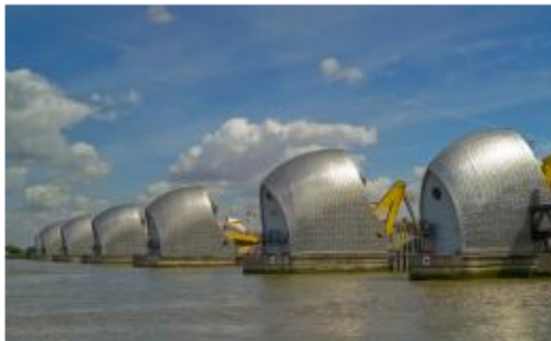
Thames Barrier

Sea levels could rise by a maximum of 190 centimetres by the end of the century, according to a new study, which examines a worst case scenario for sea level rise.