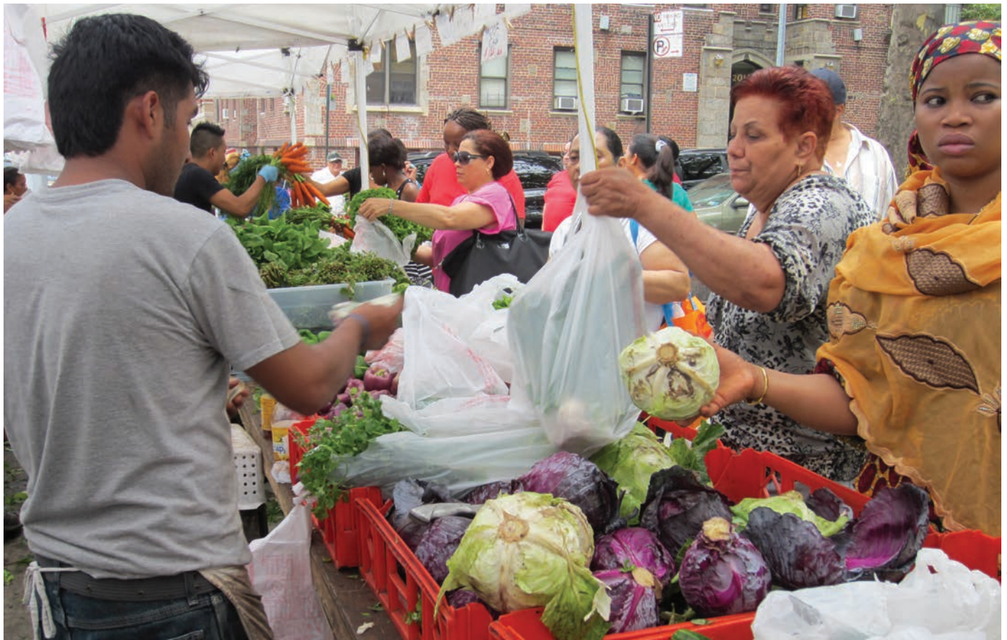
The Mt. Eden Harvest Home Farmer's Market in New York City provides fresh produce to a range of customers including patients of Bronx-Lebanon Hospital Center.

A recent study of select tax-exempt hospitals found that they devoted an average of 8 percent of expenses to community benefits. Actual community benefit expenditures by all nonprofit hospitals nationwide are not reported, but we calculate that they total about $33 billion.