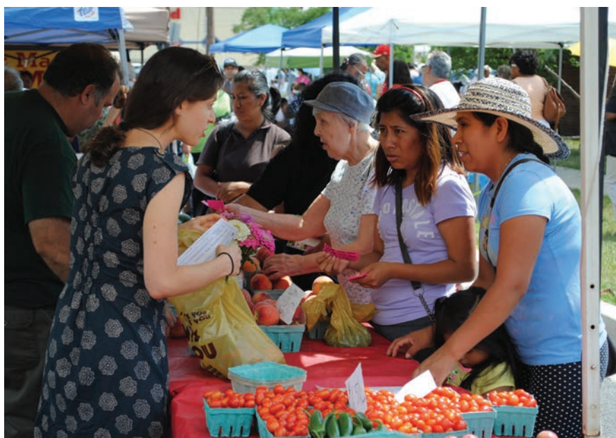
Farmers markets, like the Crossroads Farmers Market in Takoma Park, MD, provide communities with direct access to fresh fruits and vegetables.

It is well established that metabolic syndrome and associated diseases are largely preventable through healthy lifestyle behaviors such as maintaining a healthy diet. Yet the typical American diet misses the mark. On average, Americans eat only about half the amounts of fruits and vegetables recommended by federal dietary guidelines, while consuming too much meat, processed foods, and added sugars. In addition, the U.S. food system that consumers must navigate daily is highly inequitable, making it more difficult for some to maintain a healthy diet than it is for others. That is,