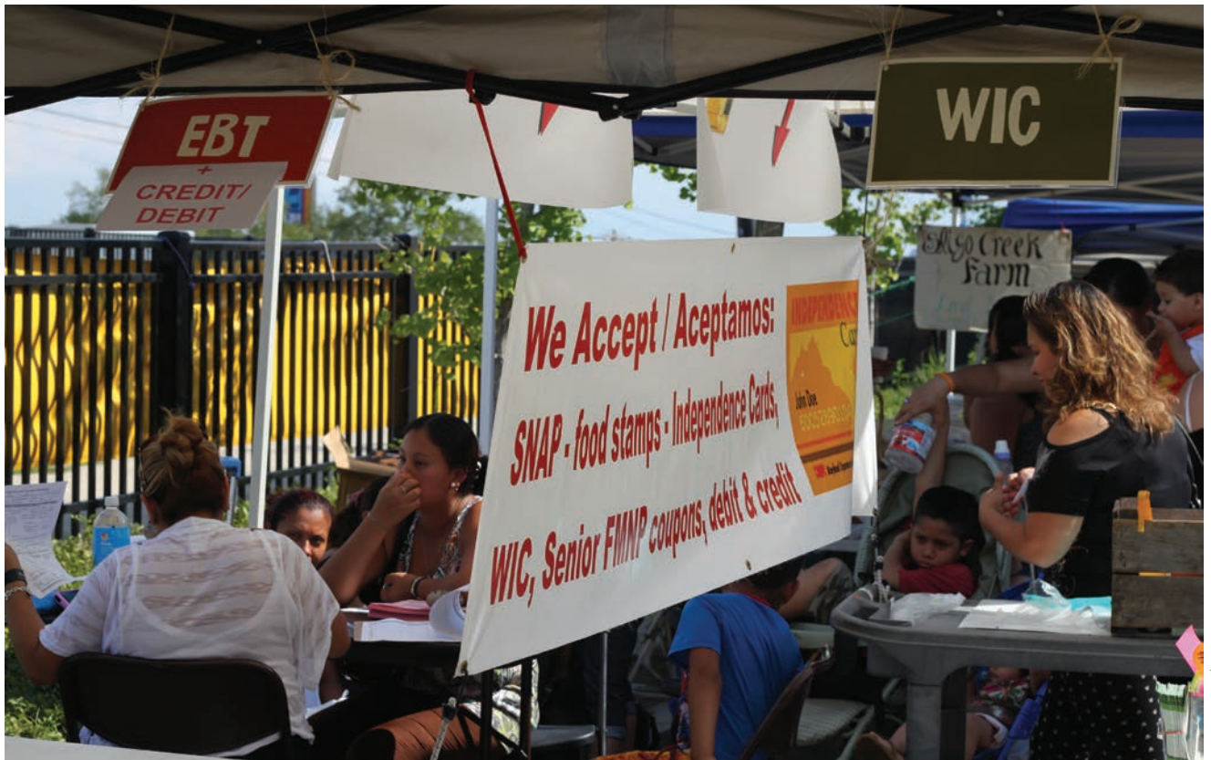
Every growing season, Crossroads Farmers Market in Takoma Park, MD, serves thousands of people who receive food assistance benefits.

The Crossroads Community Food Network and the MDFMA are examples of organizations eligible for funding through the FINI program. And local Maryland hospitals could offer needed help, given that the Centers for Medicare and Medicaid Services are requiring the state’s hospitals to achieve $330 million in Medicare savings by 2019. Our review of community benefit reports from Maryland’s 46 nonprofit hospitals showed that 80 percent of them offer screening or education programs related to diet or a diet-related chronic disease, but none is significantly involved in food system efforts beyond its own campus.