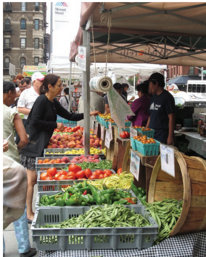
Grow NYC runs a bustling farmers market outside Mt. Sinai Hospital in New York City, offering healthy food to patients and doctors alike. Shoppers receive a two-dollar voucher for every five dollars in food assistance benefits they use. FINI funds will expand programs like these across the country.

The Food Insecurity Nutrition Incentive (FINI) program will provide grants to organizations seeking to increase low-income consumers’ purchases of fruits and vegetables at farmers markets and elsewhere.