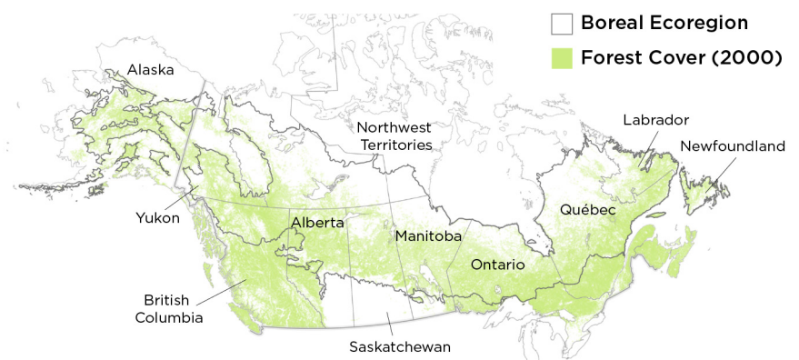
FIGURE 1. The Boreal Biome

The boreal region of North America, spanning the United States and Canada. Forest cover denotes forested land as of 2000.