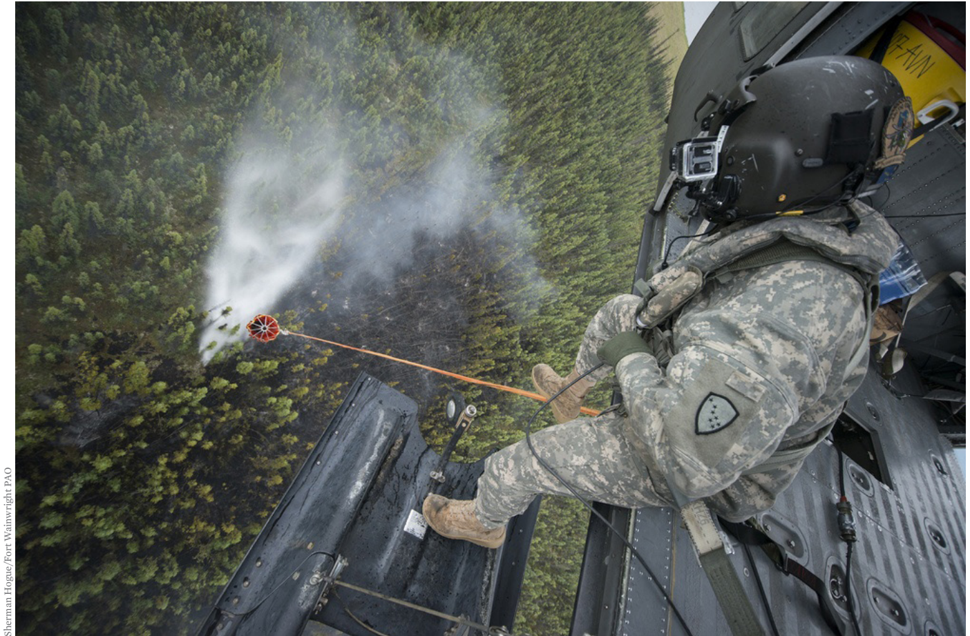
Sherman Hogue/Fort Wainwright PAO

Directing more resources towards fire suppression in Alaska's boreal forests not only protects the health and safety of Alaskan communities, but can also reduce the carbon emissions that drive climate change.