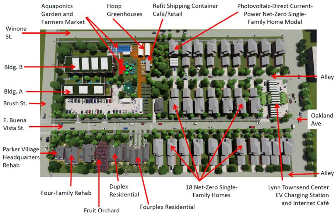
Figure 1. Parker Village Comprehensive Plan