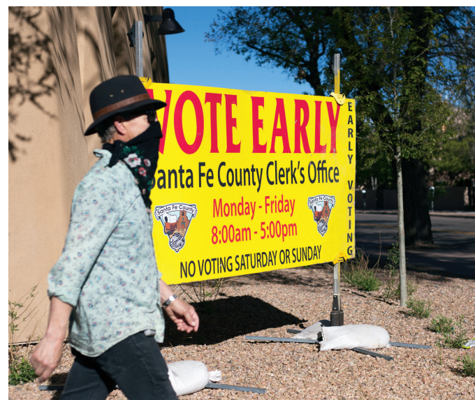
Voting by mail may be the safest way for people to vote this November, but for many, voting in-person is their only option. Polling places must be located away from vulnerable populations and open early in order to protect voters and poll workers.

Voting centers should be opened at least two weeks before Election Day to prevent long lines and crowded polling places.