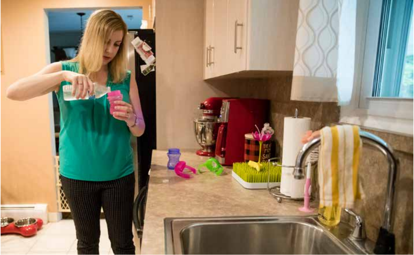
PFAS are a class of human-made chemicals used in manufacturing and in firefighting foam. Use of PFAS can contaminate surrounding water supplies, causing thyroid disease and cancer in humans. The effects of PFAS are especially damaging to the developing bodies of children. Above, a mother provides her child with bottled water in Horsham, Pennsylvania, which has been experiencing PFAS contamination from a nearby naval base.

living near military and industrial sites bear the financial burden of paying for improved filtration of their drinking water and for the medical bills associated with health impacts.