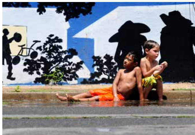
Children are particularly susceptible to the effects of extreme heat because they are less able to read their own bodily cues and know when to rehydrate.

Children face particular risks from air pollution since their lungs are still developing and they frequently play outside.