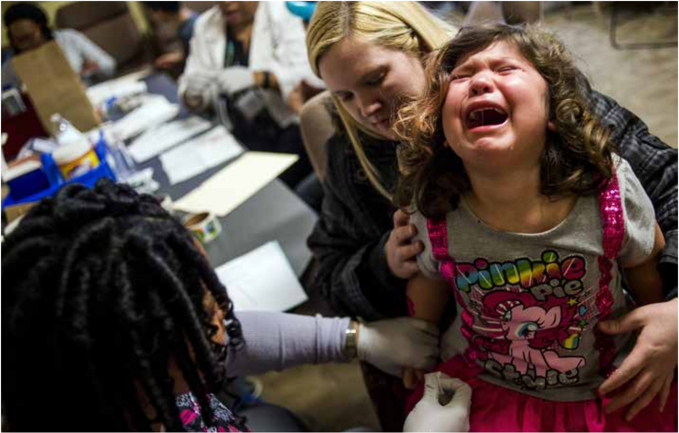
Exposure to lead can cause irreversible damage to children's nervous systems. Here, a mother holds her daughter as she is tested for lead in Flint, Michigan, where contaminated water supplies continue to plague the community.

However, the EPA neglected to require the replacement of 6 million water service lines made of lead. The EPA also failed to lower the level of lead in drinking water at which the agency is required to step in and provide enforcement—known as its lead action level, currently 15 parts per billion—to be more in line with public health research showing that no level of lead exposure is safe for children (CDC 2019a). And the new rule has reduced the percentage of lead water service lines that must be replaced in communities that have reached the lead action level, from 7 percent of water lines to 3 percent.