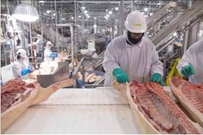
The Trump administration is taking action to increase conveyor line speeds and reduce safety inspections at pork processing plants, putting consumers at higher risk of contracting foodborne illness. Because children’s immune systems are still developing, they are less able to fight off infections and are more likely to suffer severe complications from foodborne illness.

about food safety and worker safety” (GAO 2013). One facility reported that inspectors were given approximately one second for every three poultry carcasses—insufficient time to inspect for food safety hazards such as fecal contamination. The USDA has thus far failed to demonstrate the safety of high line speeds through objective and statistical methodology, not having yet done rigorous monitoring to show the new system can be implemented without harm to public health (Sewell 2014).