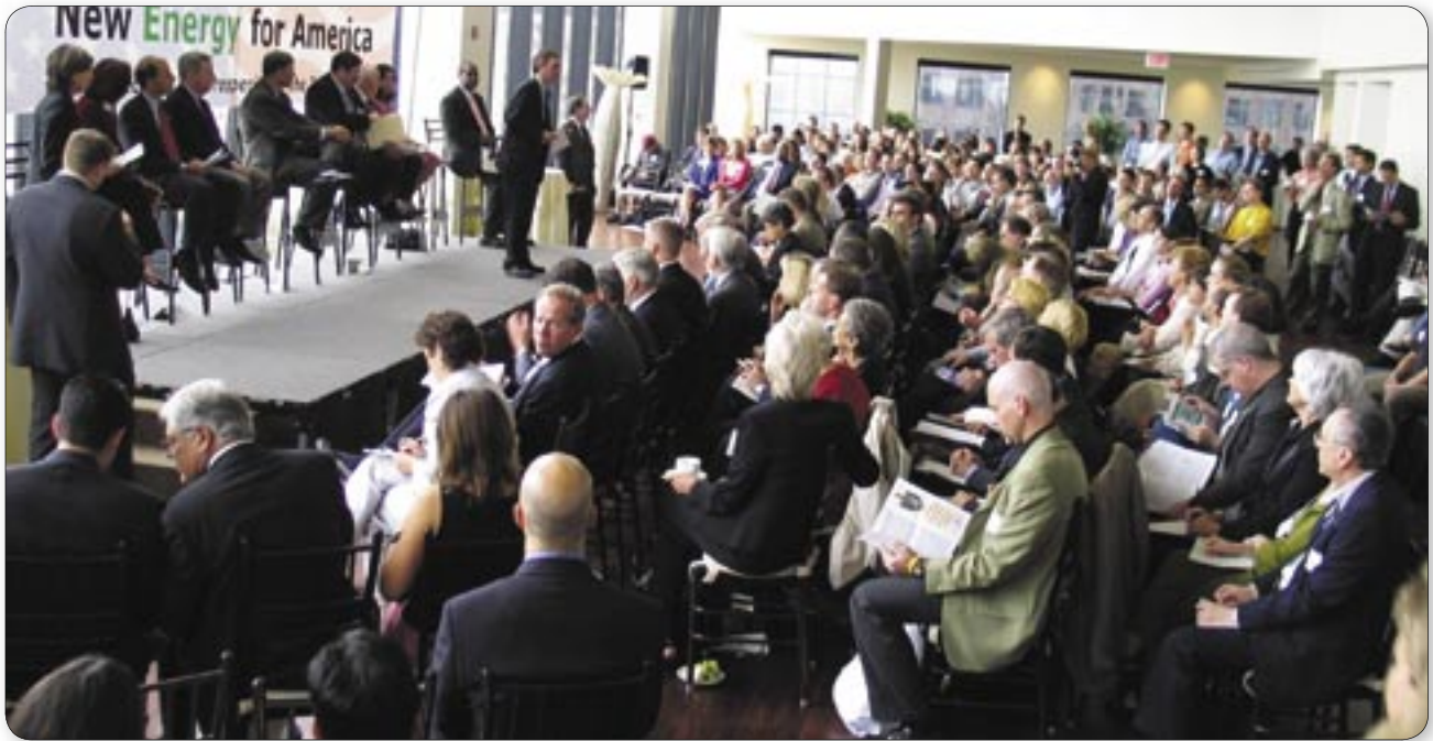
More than 600 people were on hand at the New Energy for America event.

Politically, developing our own alternative energies is dynamite. It is dynamite because it answers not one problem, but three. It breaks our addiction to Middle East oil, thereby increasing national security. It solves global warming. And it will create millions of new well-paid jobs.