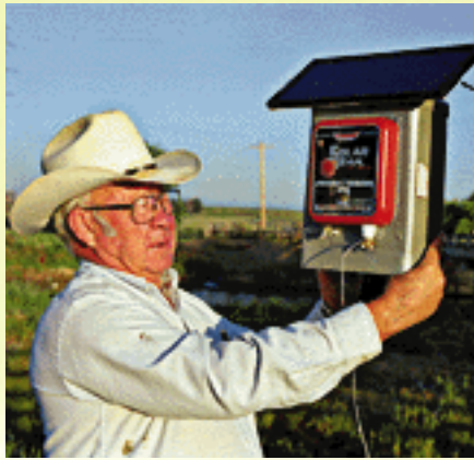
Solar power charges an electric fence on this Colorado ranch.