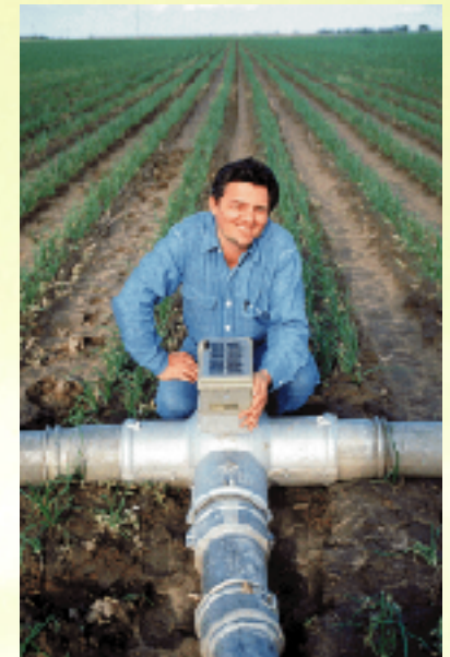
Solar power controls this irrigation system.

Solar energy—power from the sun—is clean and unlimited. Capturing the sun's energy for light, heat, hot water, and electricity can be a convenient way to save money. Whether drying crops, heating buildings, or powering a water pump, using the sun can make the farm more efficient.