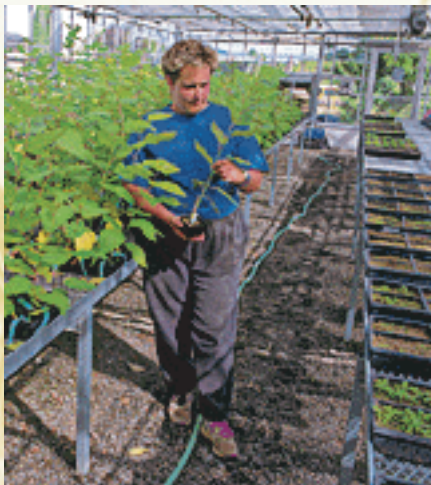
The sun is a reliable source of heat, light, and power for greenhouses.

Commercial greenhouses often rely on the sun for lighting, but on gas or oil heaters to maintain constant temperatures. A solar greenhouse uses building materials to collect and store solar energy as heat. Insulation retains the heat for use during the night and on cloudy days. To capture the most sunlight, a solar greenhouse generally faces south, while its northern side is well insulated, with few or no windows. A gas or oil heater may be used as a backup.