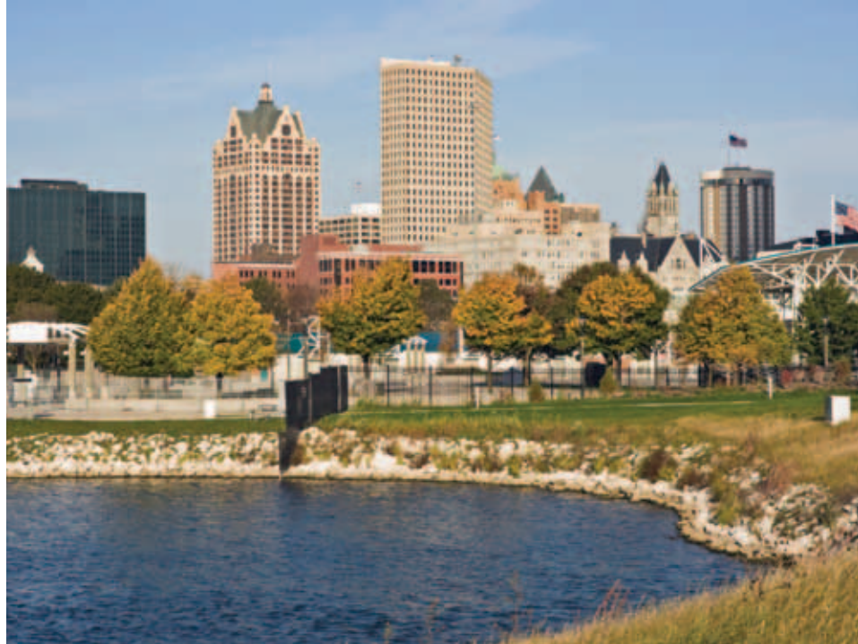
Milwaukee, Wisconsin. The cost of importing coal is a drain on Wisconsin's economy, which relies heavily on coal-fired power. Investments in energy efficiency and homegrown renewable energy can help stimulate the economy by redirecting funds into local economic development—funds that would otherwise leave the state.

We Energies, the state's largest provider of electricity services, purchased $313 million in coal imports—about 30 percent of the state's total, and more than any other Wisconsin power producer. The utility's Pleasant Prairie facility, in Kenosha County, is also the most import-dependent power facility in Wisconsin, having spent $127 million in 2008.