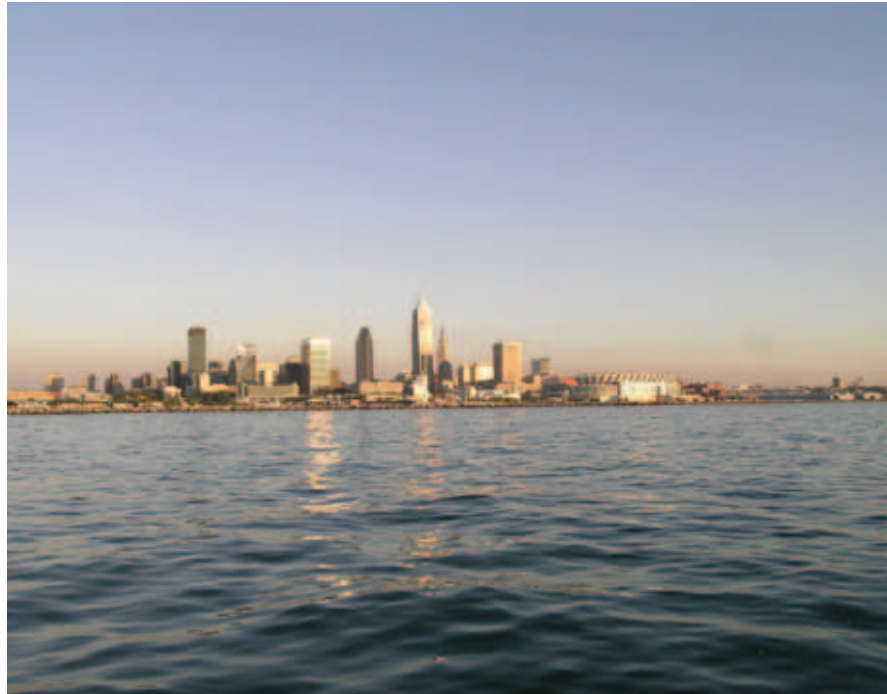
Cleveland, Ohio. The cost of importing coal is a drain on Ohio's economy, which relies heavily on coal-fired power. Investments in energy efficiency and homegrown renewable energy can help stimulate the economy by redirecting funds into local economic development—funds that would otherwise leave the state.

First Energy Generation, Ohio's second-largest provider of electricity services, purchased $570 million in coal imports—30 percent of the state's gross total, and more than any other power producer in the state. First Energy's W.H. Sammis plant, in Stratton, spent $291 million on coal imports—more than any other power plant in Ohio. The plant is the twenty-first-largest source of carbon dioxide emissions (the main cause of global warming) among hundreds of coal plants nationwide.