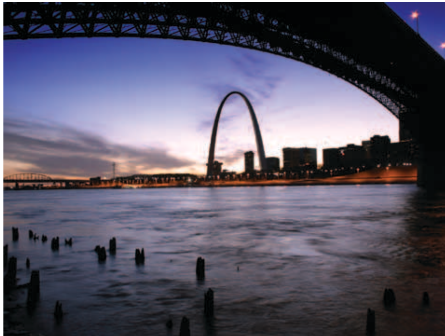
St. Louis, Missouri. The cost of importing coal is a drain on Missouri's economy, which relies heavily on coal-fired power. Investments in energy efficiency and homegrown renewable energy can help stimulate the economy by redirecting funds into local economic development—funds that would otherwise leave the state.

AmerenUE, Missouri's largest provider of electricity services, purchased $565 million in coal imports in 2008—half the state's gross total and more than any other Missouri power producer. AmerenUE's Labadie plant, in Franklin County, is also the most import-dependent power facility in Missouri, having spent $241 million in 2008. The plant is the eleventh-largest source of carbon dioxide emissions (the main cause of global warming) among hundreds of coal plants nationwide.