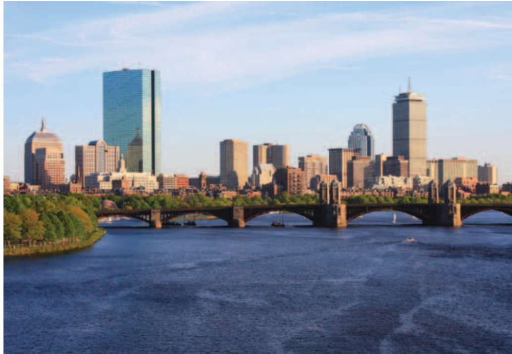
Boston, Massachusetts. The cost of importing coal to fuel power plants is a drain on Massachusetts' economy. Investments in energy efficiency and homegrown renewable energy can help stimulate the economy by redirecting funds into local economic development—funds that would otherwise leave the state.

Massachusetts imported all the coal its power plants burned in 2008—primarily from Colombia. To pay for that coal, Massachusetts sent $252 million out of state. Dominion Energy New England, one of the largest independent power producers in the state, purchased all that imported coal. Dominion's Brayton Point plant, in Somerset, spent $214 million on coal imports—more than any other coal plant in Massachusetts.