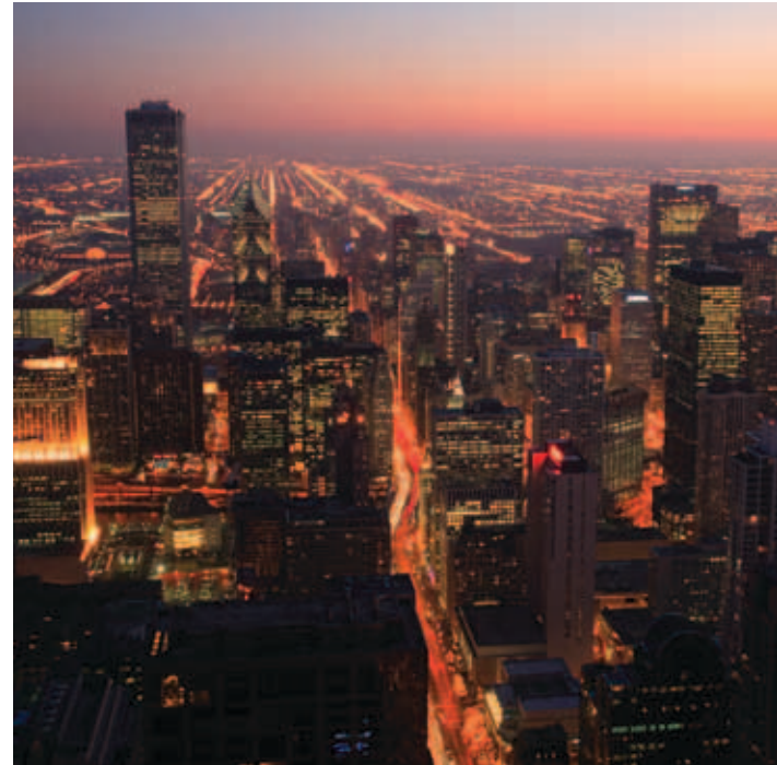
Chicago, Illinois. The cost of importing coal is a drain on Illinois' economy, which relies heavily on coal-fired power. Investments in energy efficiency and homegrown renewable energy can help stimulate the economy by redirecting funds into local economic development—funds that would otherwise leave the state.

Because Illinois plants export some of the power they generate, some of the financial costs of these coal imports may shift to electricity consumers in other states. If that occurs, Illinois residents would bear the environmental costs of burning the imported coal (such as air emissions, water use, and ash disposal) without benefiting from the resulting power.