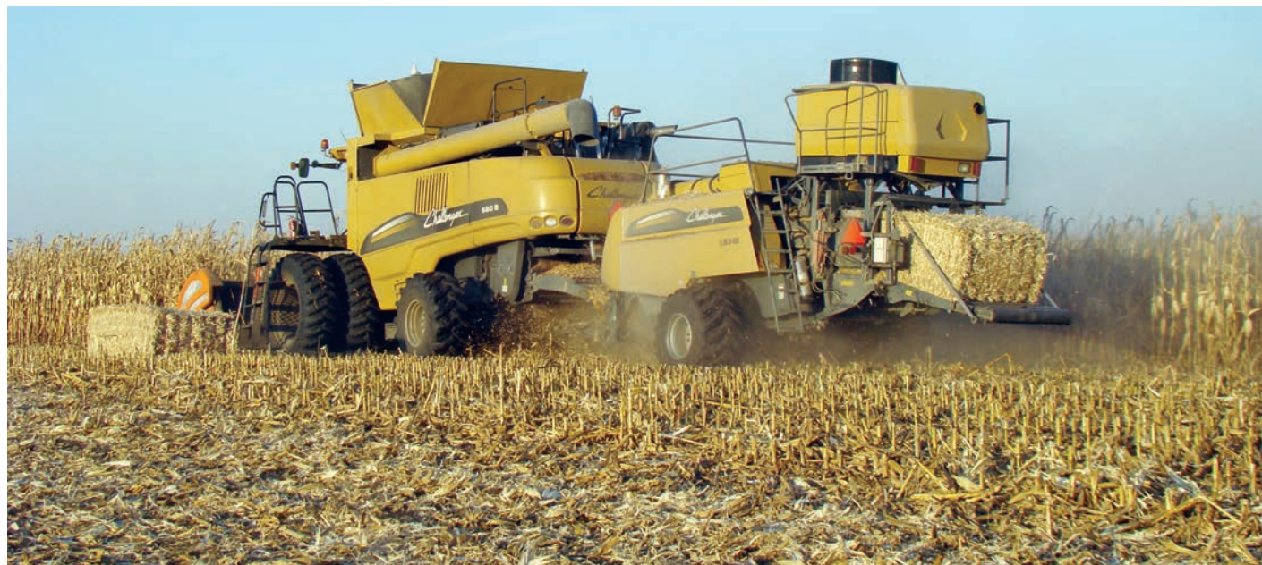
Agricultural residues are a natural by-product of primary crops such as corn and can be used to generate energy or fuel.

While removing residues for use in producing bioenergy absent any other changes in agricultural practices could worsen existing environmental challenges, farmers can adapt their practices to minimize the potential harm. For example,