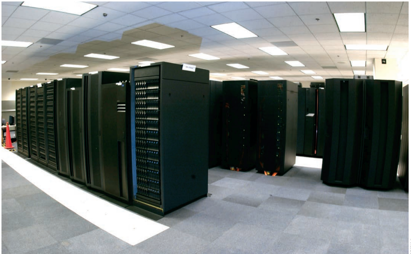
The National Oceanic and Atmospheric Administration's Environmental Security Computing Center in Fairmont, WV, will develop and improve the accuracy of global and regional climate and weather model predictions.