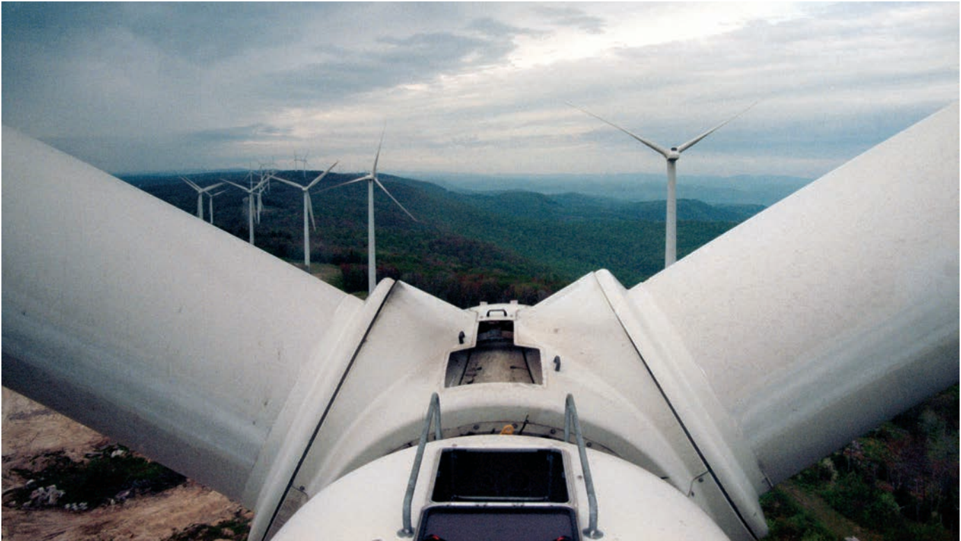
Florida Power and Light's Mountaineer Wind Energy Center produces a maximum of 66 megawatts of electricity. Each turbine stands 228 feet above Backbone Mountain and has blades of 115 feet that weigh just over eight tons.